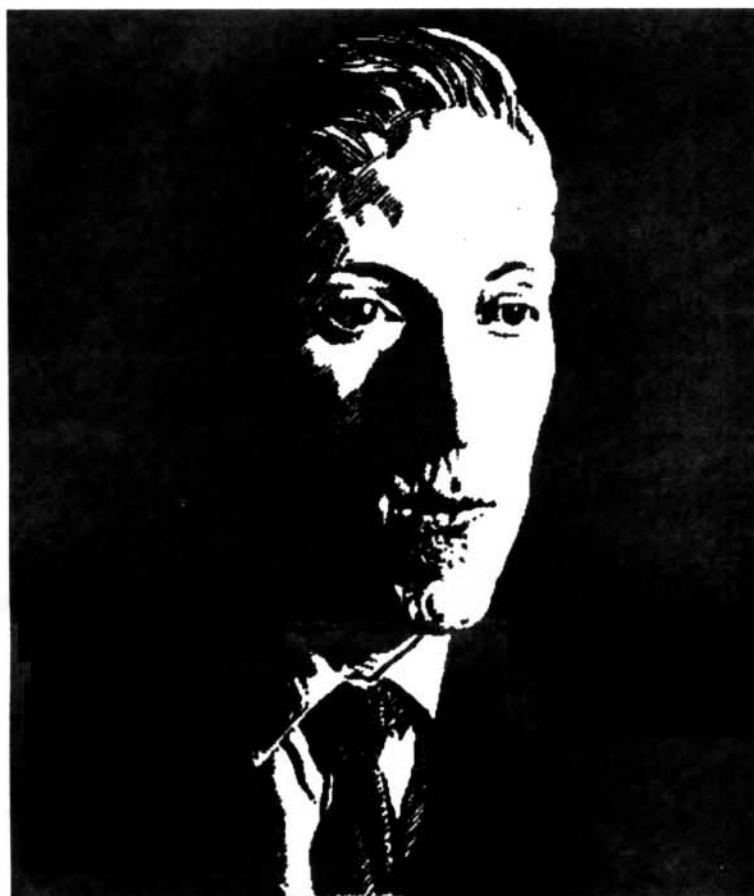
H. P. LOVECRAFT

It was in 1919 that he wrote one of his best-known stories "Beyond the Walls of Sleep,"